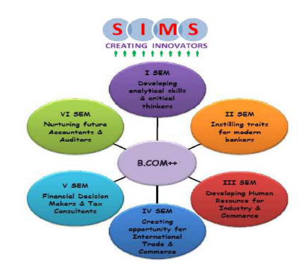
Figure 4: B.Com.<sup>++</sup> Model

The value added B.Com. model called B.Com.<sup>++</sup> is shown in Figure 4. In first semester, B.Com. students study six subjects as per university curriculum and institutional value added programmes with focus on developing analytical skills for critical thinking. In second semester along with university curriculum, the value added programmes are designed with an emphasis to instill traits for modern bankers. In third semester along with university curriculum, the value added programmes are designed with an emphasis to develop human resources for industry and commerce. In fourth semester along with university curriculum, the value added programmes are designed with an emphasis to develop human resources for industry and commerce. In fourth semester along with university curriculum, the value added programmes are designed with an emphasis to prepare students as financial decision makers and tax consultants. In sixth semester along with university curriculum, the value added programmes are designed with an emphasis to prepare them effective accountants and auditors. The details of value added programmes during each semester of B.Com. programme are listed in Table 8.