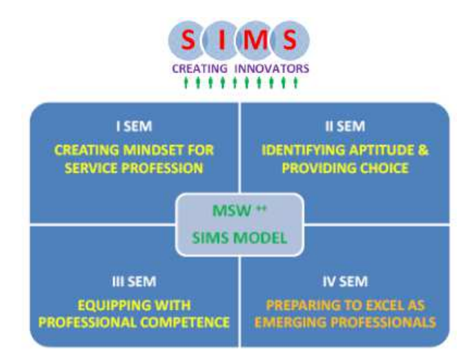
Figure 2: MSW<sup>++</sup> Model

In MSW++ model as shown in figure 2, the curriculum and the pedagogy are designed in such a way to create a mindset for social service profession. Through properly planned orientation programme, field visits, field work practicum, university subjects, value added chapters, certificate programmes, modular programmes, workshops, guest lectures and cocurricular and extra-curricular activities, students are prepared to focus their mindset and love the social work service as a profession. The students study five compulsory subjects and carryout field work practicum in a reputed NGO depending on their choice as a part of university syllabus. The details of the curriculum are given in Table 2 to 5. The details of value added programmes during each semester of MSW programme are listed in Table 6.