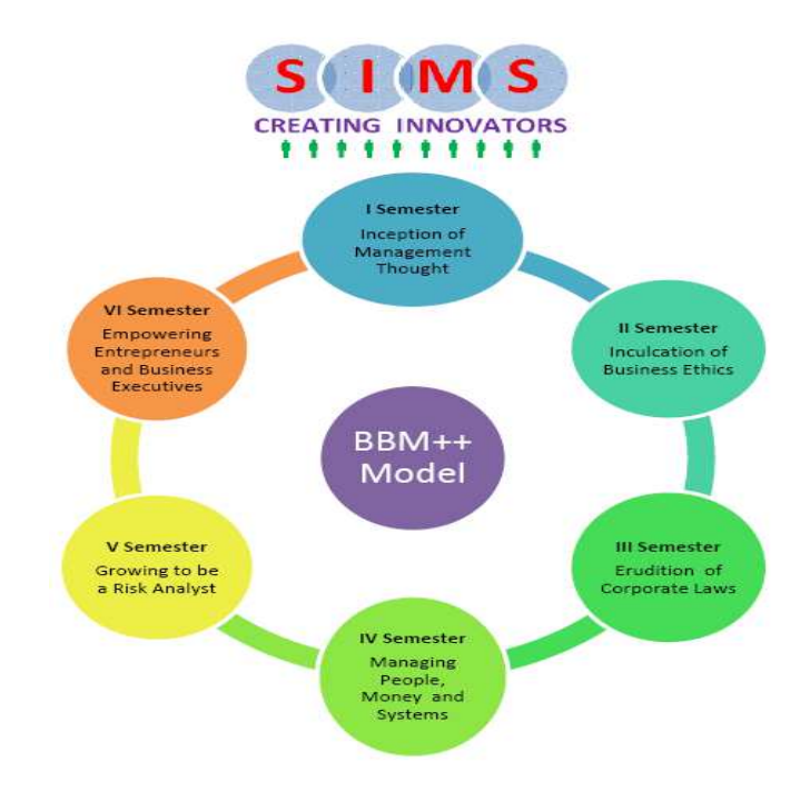
Figure 5: BBM<sup>++</sup> Model

The value added BBM model called BBM.<sup>++</sup> is shown in Figure 5. In first semester, BBM students study six subjects as per university curriculum and institutional value added programmes with focus on inception of management thought. In second semester along with university curriculum, the value added programmes are designed with an emphasis to inculcate business ethics. In third semester along with university curriculum, the value added programmes are designed with an emphasis to erudition of corporate laws. In fourth semester along with university curriculum, the value added programmes are designed with university curriculum, the value added programmes are designed with university curriculum, the value added programmes are designed with university curriculum, the value added programmes are designed with an emphasis to prepare students as risk analyst. In sixth semester along with university curriculum, the value added programmes are designed with an emphasis to prepare students as risk analyst. In sixth semester along with university curriculum, the value added programmes are designed with an emphasis to prepare students as risk analyst. In sixth semester along with university curriculum, the value added programmes are designed with an emphasis to prepare them as efficient entrepreneurs and business executives. The details of value added programmes during each semester of BBM programme are listed in Table 9.